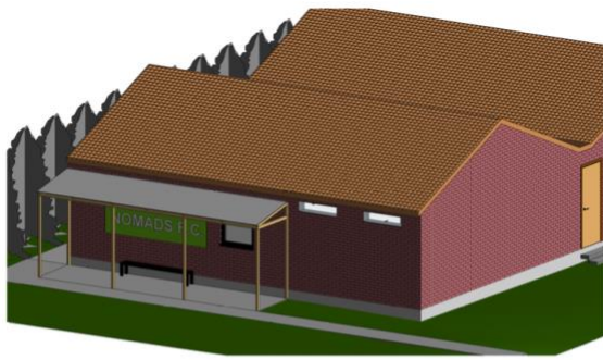
① 3D View - New Shelter & Service Window